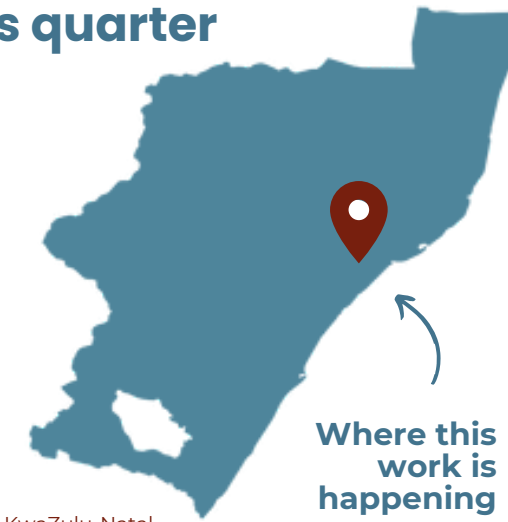
Map of KwaZulu-Natal Province, South Africa

48 Number of ECD programmes reached directly through our basket of services