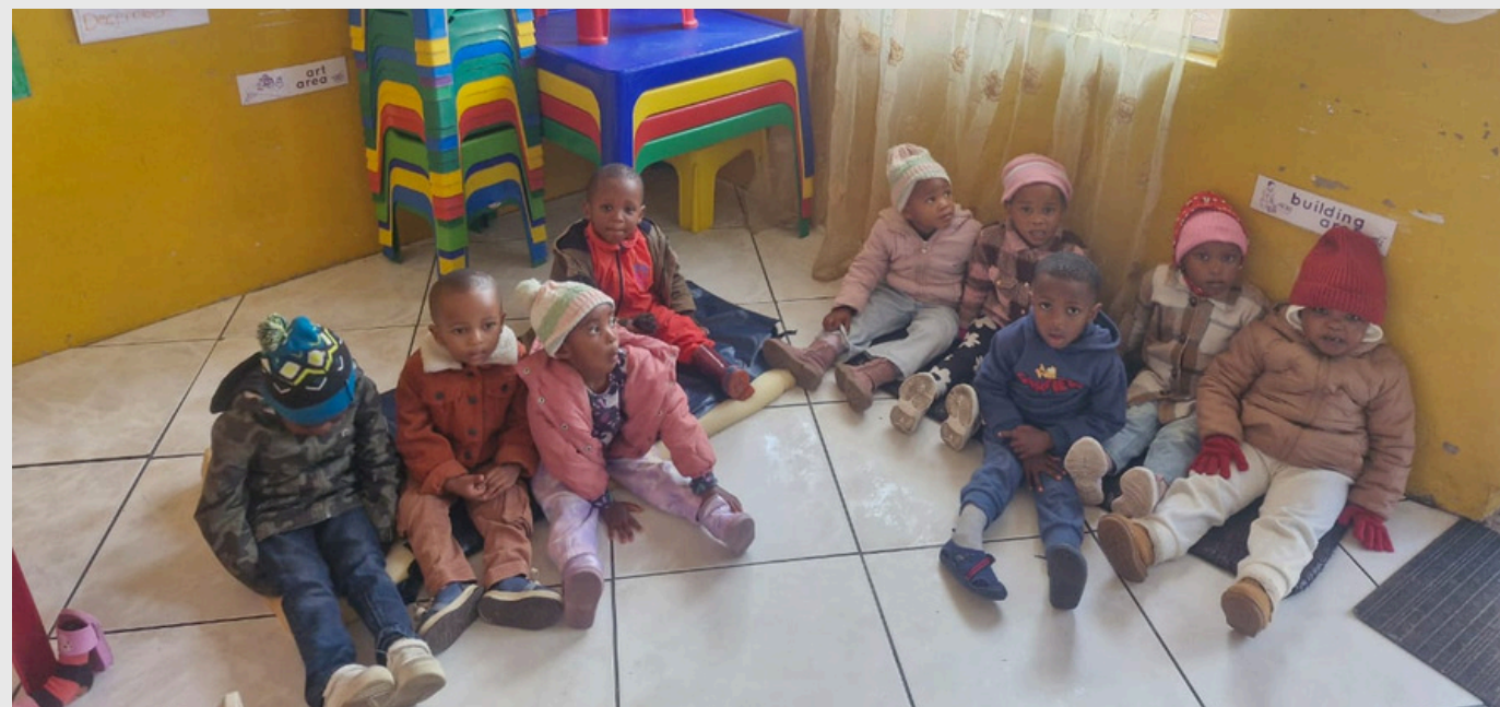
Site visit by Durban University of Technology students