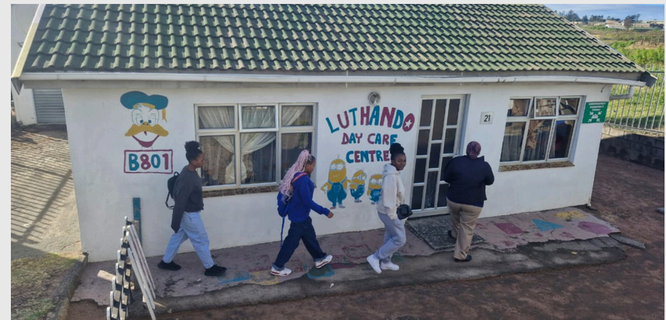
Site visit by Durban University of Technology students