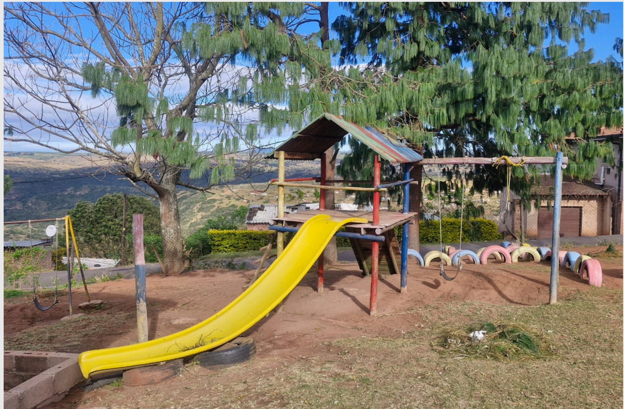
Site visit by Durban University of Technology students