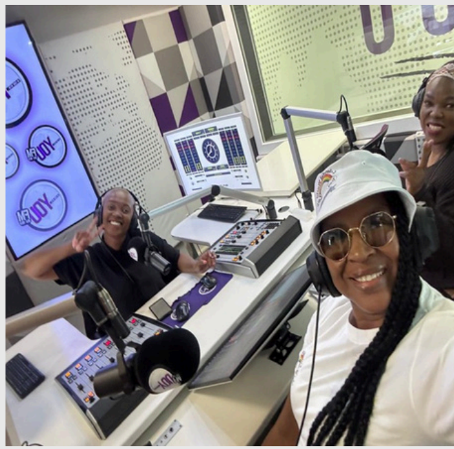
Community Radio: YOU FM