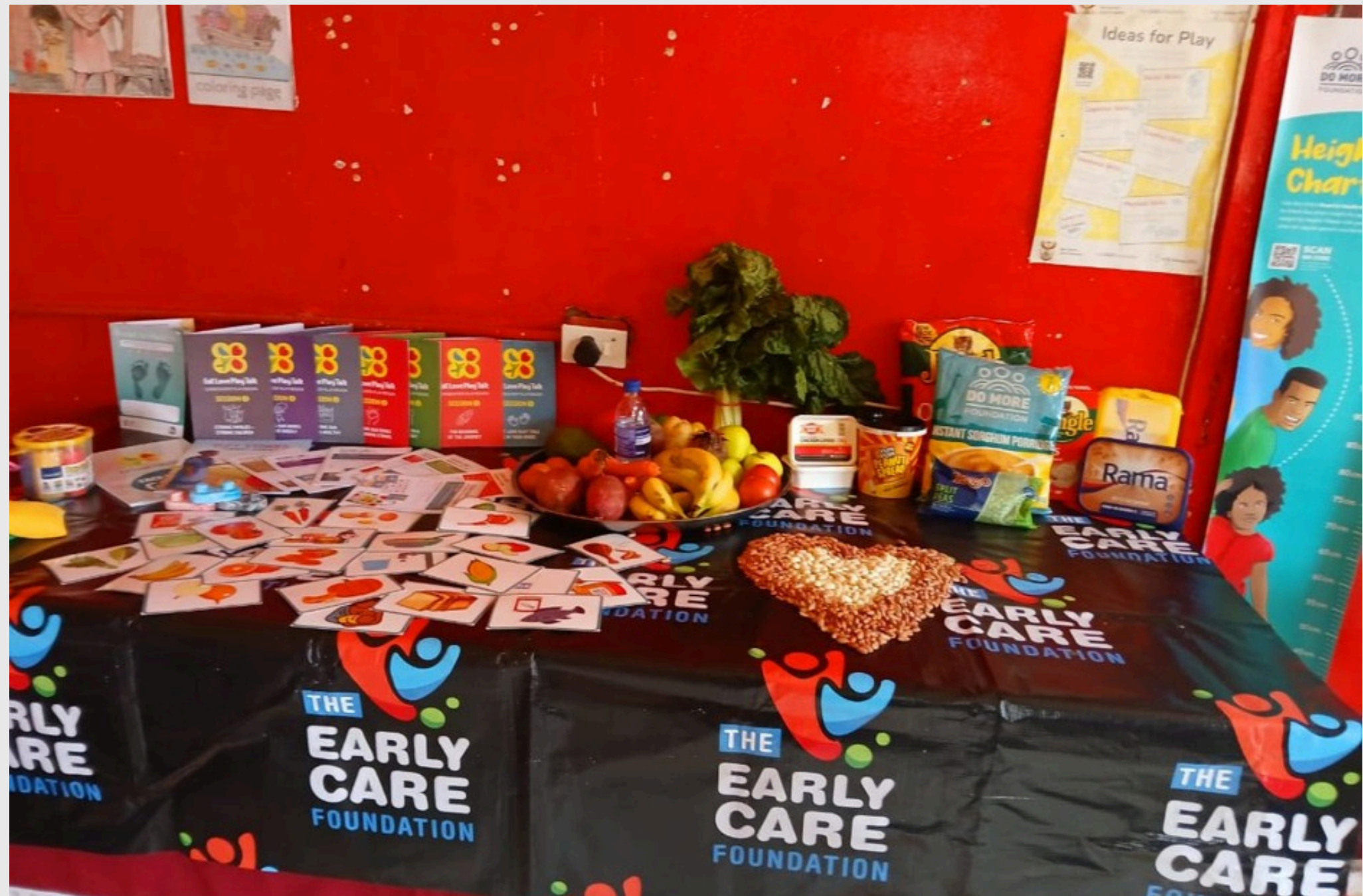
EAT LOVE PLAY TALK session