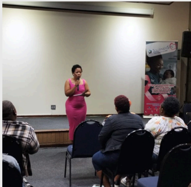
Young Child Forum: Breast Cancer Awareness