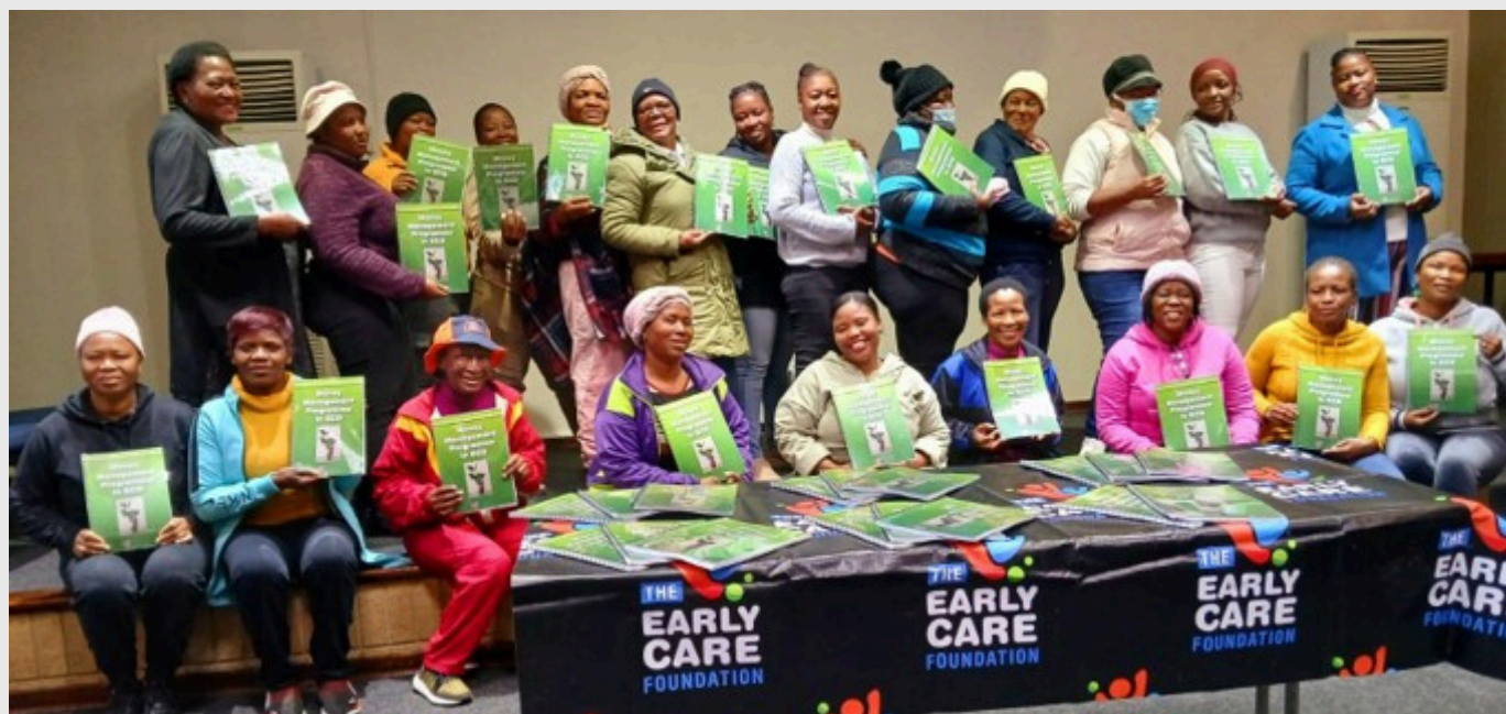
Money Management training