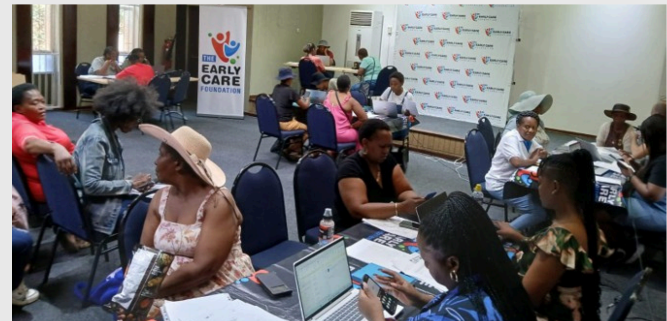
Mass Clinic Registration